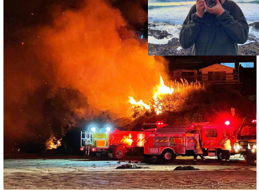
Northern Advocate - The fire closed in on beachfront homes that were evacuated overnight. Photo / Ahiparadise - Photography by Lennox Goodhue Wikitera